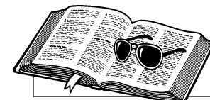
Summer Worship Schedule

8:30 am Bible Study Board Room 10:00 am Worship Sanctuary 11:00 am Fellowship Library 11:00 am Deacons Board Room 5:00 pm Inspire! Worship Service Chapel 6:00 pm Pot Luck Supper, Youth Fellowship Thomson Youth Center 6:30 pm Grief Seminar Chapel, Library, Bates Hall