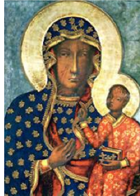
~Our Lady of Czestochowa~